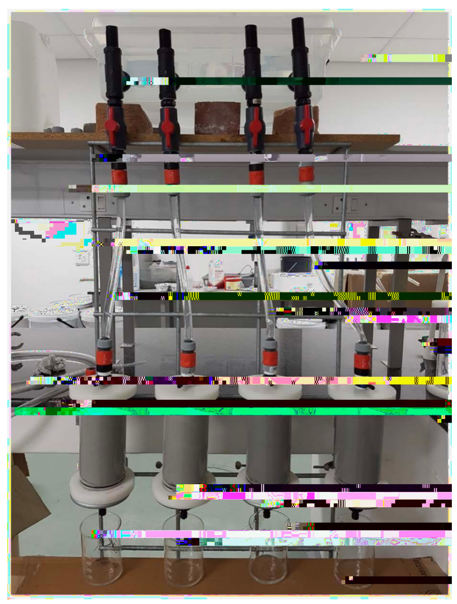
Figure 5. Acid mine drainage neutralization testing

The aim of this study was to investigate the neutralization capacity of columns of Kendal and Lethabo fly ash for the treatment of Eyethu AMD. The experiment was successful as it was proven that Eyethu AMD can be treated by passively flow through coal fly ash. The pH was raised from 2 to over 12 by the dissolution of oxide component in the ash and hydrolysis of the major and trace elements in AMD once in touch with coal fly ash. There was a substantial removal of metals including Fe, Al, Mn and Mg and removal of some other elements during this study as the pH was increasing over contact time. This study highlights three major parameters to take in consideration if passively treating AMD in columns with FA (AMD: FA ratio, the contact time, and the chemistry of the acid mine drainage). The bedvolumes of acid mine drainage used before the fly ash was exhausted was approximately 44 and show that the Kendal fly ash has a significant durability to act as a passive barrier.